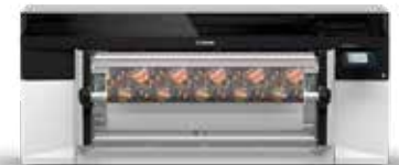
Colorado 1650 printer