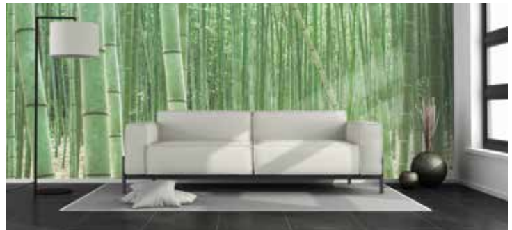
Photo wallpaper, on the other hand, looks best with a high-gloss finish that makes the colors pop. Give your customers realistic photo images that inspire.