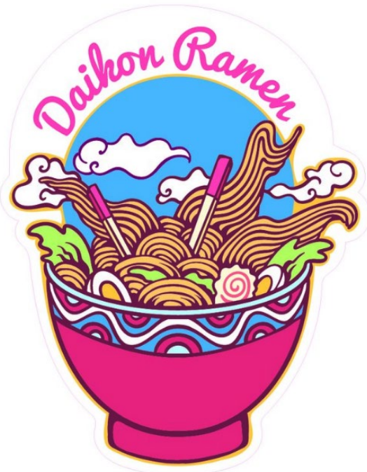
Simple Image (recommended)

Simple images with bold colors are best. If you’re not printing with white inks, then any white area in the graphics will be the holographic film showing through. Do not use graphics with special effects, i.e., shadows, gradations, etc. Below are examples of Simple vs. Complex Images.