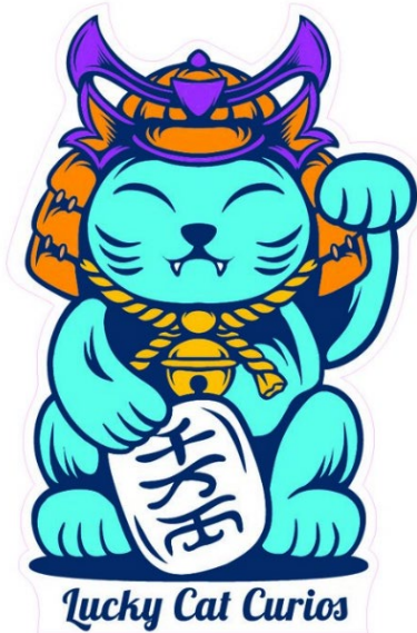
Simple Image (recommended)