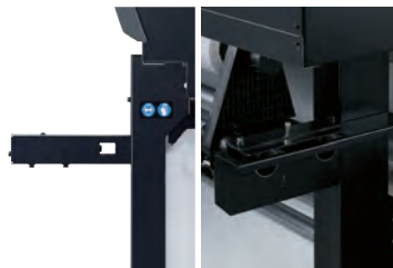
Feed Adjuster at front. Adjustable media holder at rear

The XT-640 features a bulk ink system with one-liter pouches, to ensure uninterrupted printing on long print runs. The ingenious Roland Ink Switching System automatically switches to a backup pouch when the primary pouch runs out – meaning you don't have to stop the printer to replace inks. And while you're away from the printer, the Roland Printer Assist iPad app allows remote management of common printer functions.