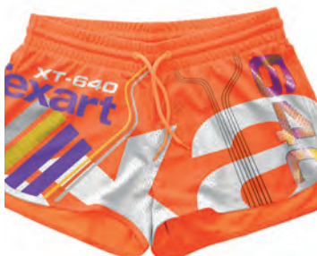
Orange and violet for vivid printing. Black ink for details and opacity. Light cyan and light magenta for smooth gradations.

The XT-640 offers exceptional media tracking to prevent alignment errors during production. An advanced vacuum system keeps transfer paper flat for printing, while a convenient new feed adjuster and take-up system prevent media skewing and ensures a correctly wound roll for smooth transition to the heat transfer process.