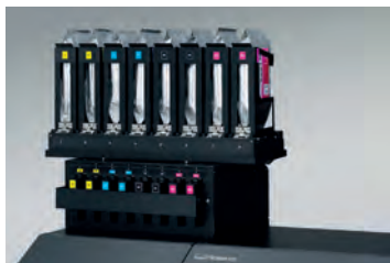
Roland Ink System.

With its rugged construction and dual print heads in a staggered formation, the XT-640 is built to meet the demanding production requirements of the textile industry, providing machine stability as well as impressive graphic output and high-speed performance. To capture every gradation and detail, each of the eight-channel print heads fire precise droplets in up to seven different dot sizes to accommodate media characteristics and desired image brightness and sharpness.