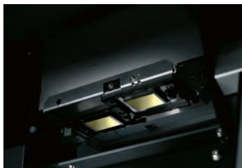
Dual print heads in staggered formation.